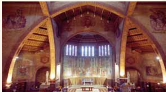
Eglise Saint-Louis

This genuine haven of fresh air and nature offers various facilities and leisure activities such as: The Flower Park, Arboretum, tropical garden, horse racecourse, farm, bicycle and boat rental, pony rides, children's playgrounds and much more.